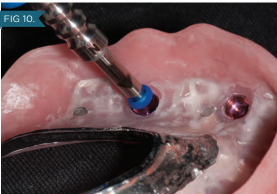
FIG 10. After a grinding bur from the Chairside® Denture Prep & Polish Kit (ZEST Anchors) was used to remove the excess of acrylic around the denture attachment housing, the retention insert tool was used to place the low-retention insert in the denture attachment housings (shown here). To facilitate the removal and insertion of the definitive overdenture, a low-retention insert and two zero-retention inserts would be placed in the denture attachment housings.