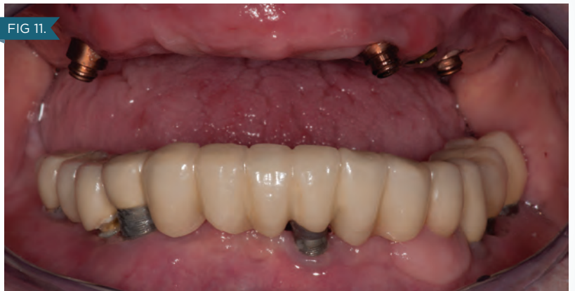
FIG 11. Frontal view showing the severe divergence between the abutments. Despite the severe divergence, the definitive denture was very retentive.