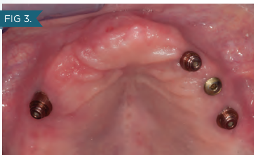
FIG 3. Occlusal view of the Locator R-Tx abutments on implants Nos. 4, 11, and 13. A cover screw was placed on implant No. 12. The Locator R-Tx abutments would be used to retain both the immediate denture and the ISO.