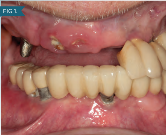
FIG 1. Frontal view of patient, a 91-year-old man who lost his maxillary FPD, showing the nonrestorable root remnants of the upper left canine and lateral. Implant No. 4 had a custom abutment screwed to the implant. Given his medical history, age, and financial limitations, the patient decided to have all the remaining implant-supported FPDs and crowns removed and receive an ISO retained by three Locator R-Tx abutments.