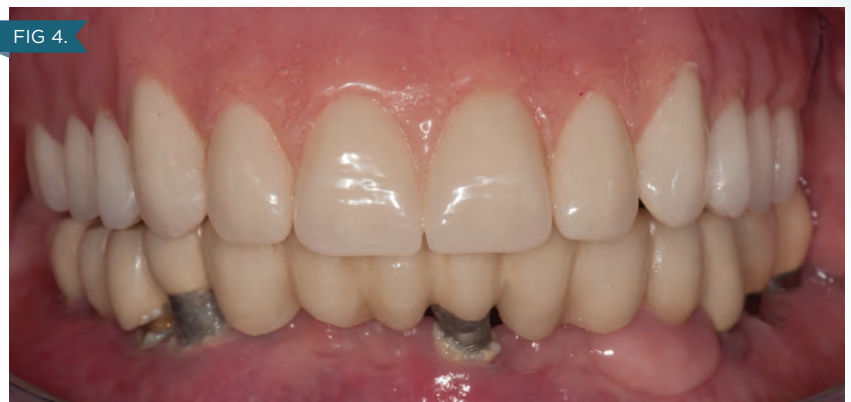
FIG 4. An immediate complete denture was delivered after the extraction of teeth remnants Nos. 6 and 7 and the removal of all remaining implant-supported FPDs and crowns.