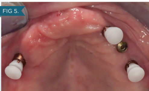
FIG 5. Locator R-Tx impression copings were securely positioned on the Locator R-Tx abutments Nos. 4, 11, and 13.